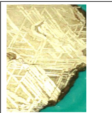
Slice Of Meteorite

For additional information , see below..