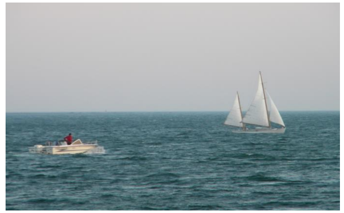
Off the coast