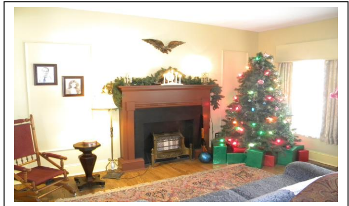
Merry Christmas and a Happy New Year