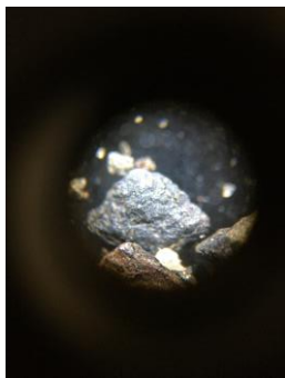
Magnetic Micro-meteorite specimen

For additional information , see below..